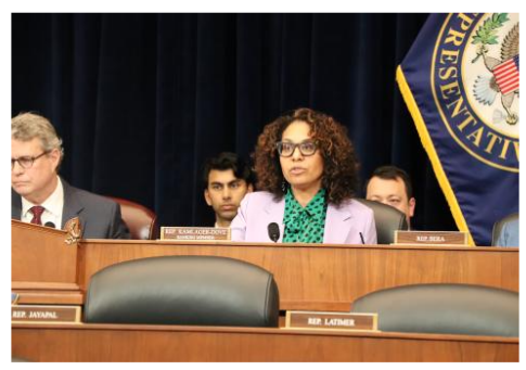
Watch the full video here. □

Subcommittee on South and Central Asia hearing, which ignored pressing bipartisan national security issues to instead repeat Republicans' false claims of right-wing censorship.